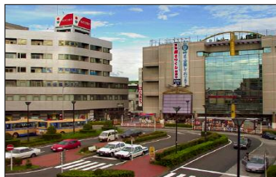
Basic color correction & image optimization