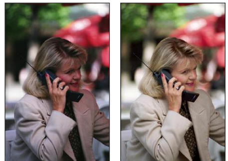
Basic color correction - fleshtones by the numbers

In most cases you can correct color, contrast and brightness by the numbers. Get a perfect flesh tone. Make sure that your images use the entire available dynamic range, without losing any detail in the highlights or shadows. Using the numbers takes all the guesswork out of it.