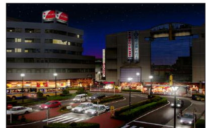
Anything worth doing is worth overdoing.

Interested? Please contact me for more info. cw@chuckwilliams.com